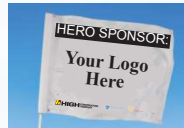
Ex: Pin Flag