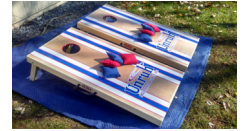
Ex: Cornhole Board with your logo; and bag colors of your choice