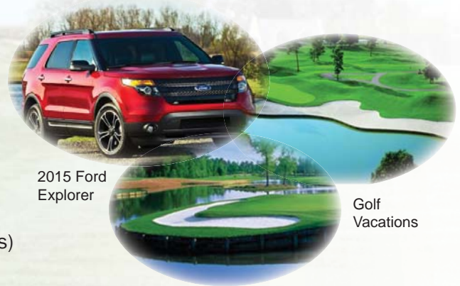
2015 Ford Explorer